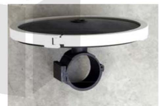
KP Clamp saddle for 2", 3", 4" & OD 90mm air header.